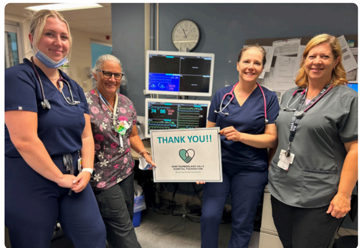
ICU Staff with Cardiac Central Monitoring