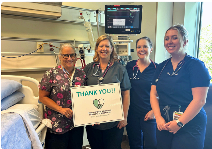
ICU Staff with Cardiac Bedside Monitor

Our communities are growing and so too is the demand on Hospital's services. This growth necessitated an expansion of the Hospital's Intensive Care Unit (ICU) to add an additional five (5) beds. The bedside monitors for these additional beds were funded with your support. By investing in cardiac monitoring, we were able to upgrade our existing monitoring capabilities, while increasing our ability to monitor both in the patient care units and remotely for practitioners not physically present on the unit.